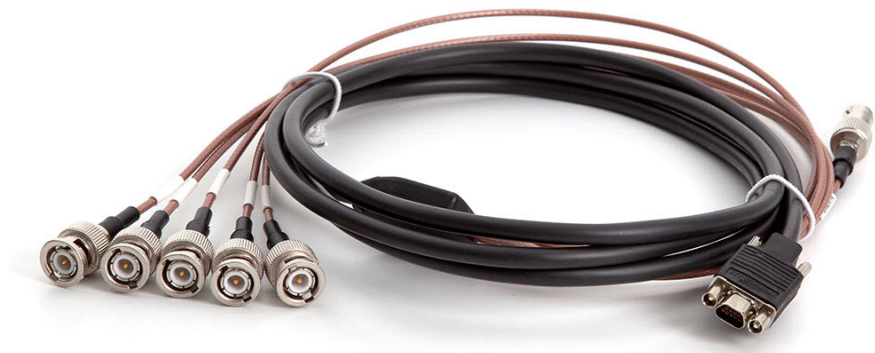
Fig. 2: Axiocam trigger cable