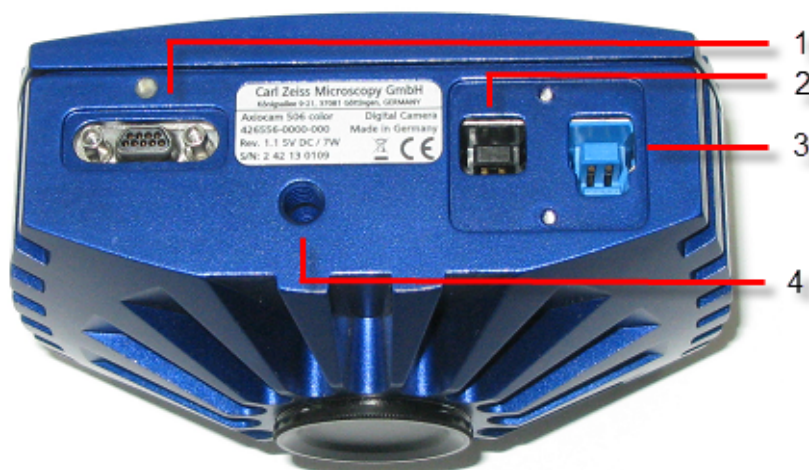
Fig. 3: Camera back