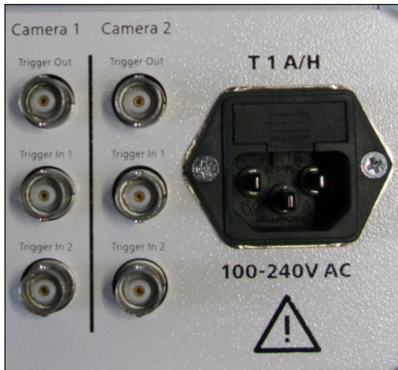
Fig. 5: Signal distribution box (SVB) backside