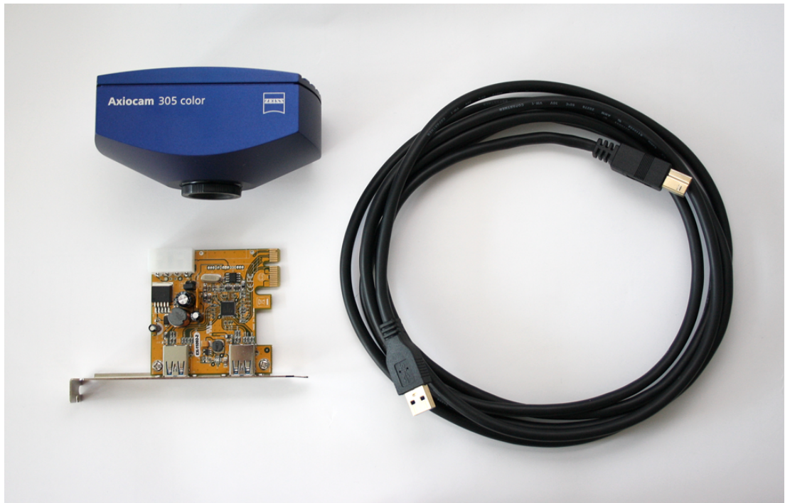
Fig. 1: Shipment Axiocam 305 color