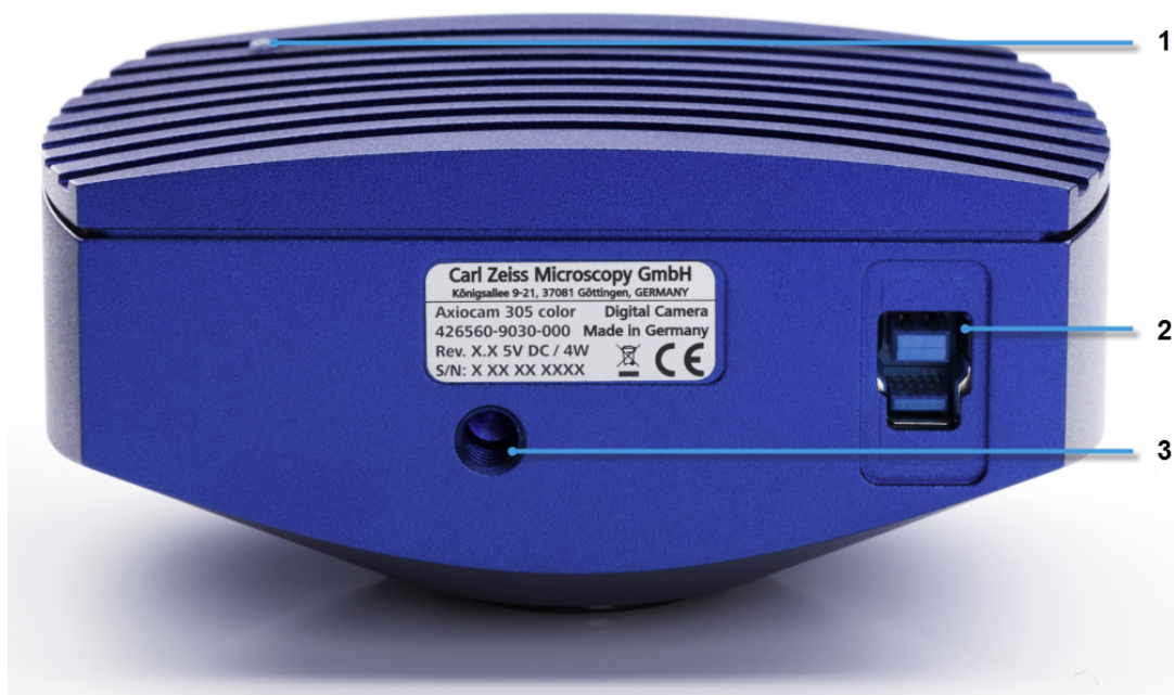
Fig. 2: Camera (Back Side)